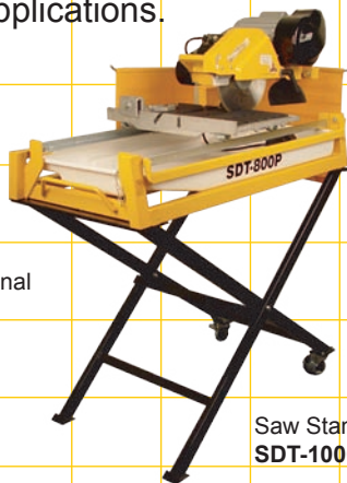
Saw shown with optional folding stand

The SDT-800P delivers improved cutting torque thanks to its 1-1/2 HP motor operating at a RPM optimized for stone applications.