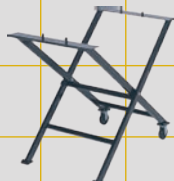
Saw Stand SDT-1000ST