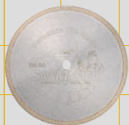
9-1/4" Porcelain Blade CR0995CL