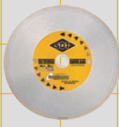
7" General Purpose CR0780R