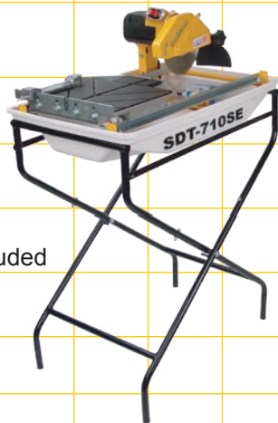
Saw Stand Included SDT-710ST

Weighing just 35 lbs, it is equipped with a respectable 1/2 HP carbon brush motor and is capable of cutting tiles up to 17" in length, making it an ideal platform for DIYs and contractors working on small tile projects.