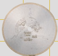
7" Cheetah Porcelain CR0780C